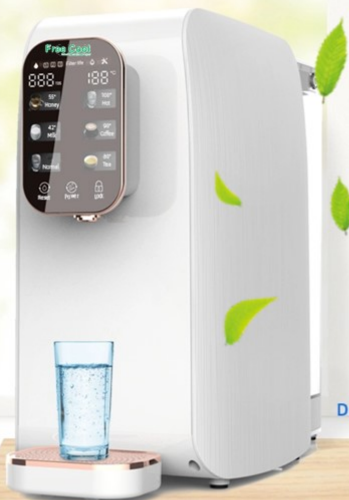
Desktop Water Purifier